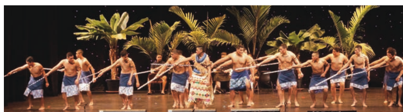
Pasifika group at the Fusion Festival