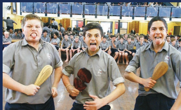
Individual winners of Year 9 Haka competition