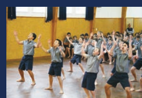
Year 9 Kapa Haka - see results on page 10