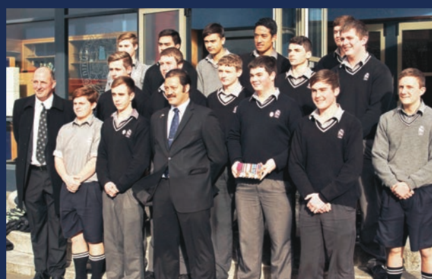
Willie Apiata, VC, at school for Leadership Week