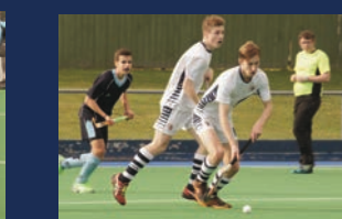
Polson Banner 2015