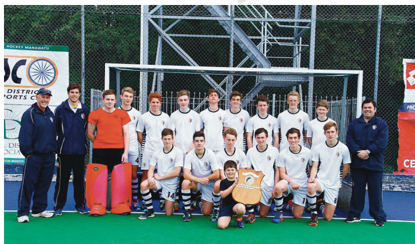
1st XI Hockey win Super 8