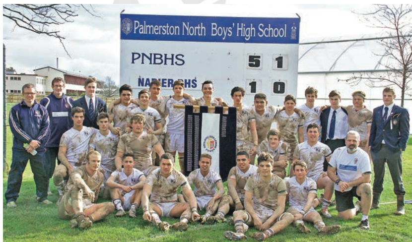
Polson Banner remains at School for 2015