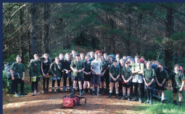
Tama Tu Tama Ora boys survive two tough weeks