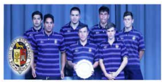
Plate Winners, Palmerston North Boys' High School

The 2015 Sevens season is well under way with two senior teams and three junior teams preparing for upcoming tournaments. The Senior Sevens team recently won the Plate Division at New Zealand Marist Secondary Schools' 7's Tournament.