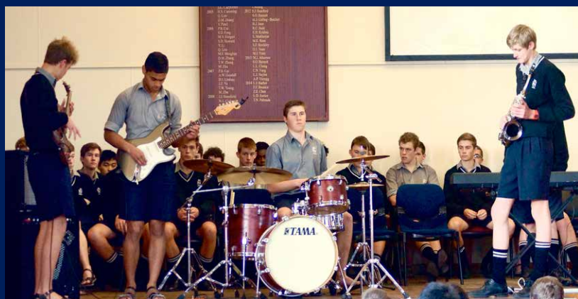
Senior music students show their talents before the school at Assembly