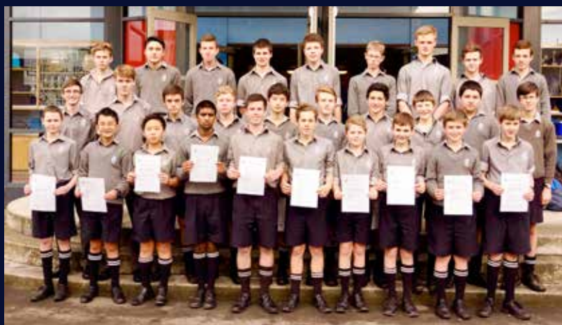
Award winners in the ICAS Science competition.