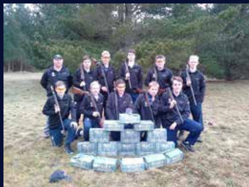
Clay Target Shooting team at nationals with some of the ammunition sponsored by Hunting and Fishing