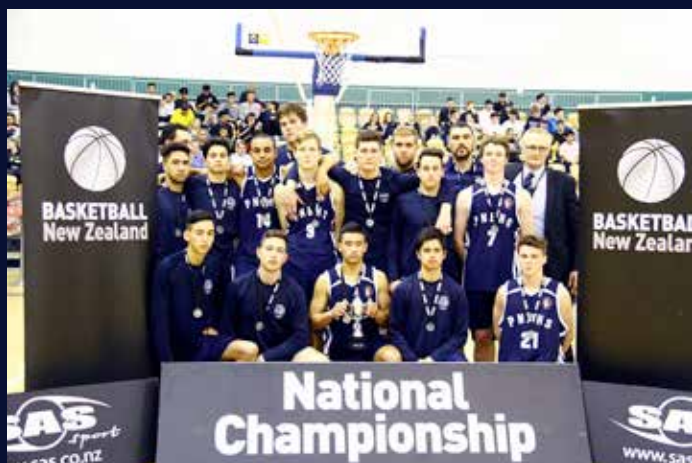
Prem A Basketball team lose National final by one point after a great tournament