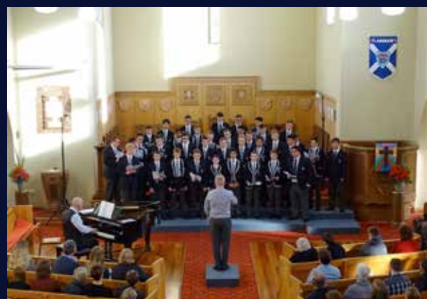
SOAP Choir perform in a choral showcase held at St Andrew's in the City along with other choirs from PN