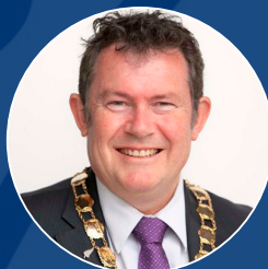
Grant Smith Mayor of Palmerston North