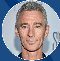
Jed Brophy Actor - 'The Hobbit'