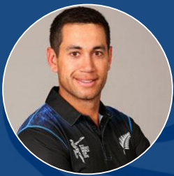
Ross Taylor NZ Black Caps Cricket Team