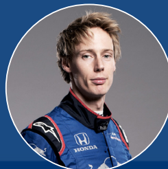
Brendon Hartley FIA Formula E