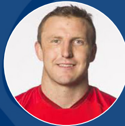
Hadleigh Parkes Wales Rugby Team