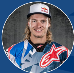
Levi Sherwood Freestyle Motorcross, Red Bull X Fighter