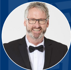
Jeremy Corbett Broadcaster, Comedian