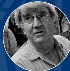
Fred Hollows Ophthalmologist, Humanitarian