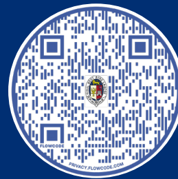
Scan to watch our Grounds Video

Sports Fields and Facilities: one rugby field, two grass training fields, covered grandstand, sports pavilion with two changing rooms, one football field, tennis pavilion with eight courts, two outdoor basketball courts, eight cricket nets, two hard-surface wickets, one grass wicket, two artificial hockey courts, two indoor volleyball courts, badminton, water and canoe polo, electronic timing gates, heart rate monitors and taekwondo bags, pads, boards and gloves.